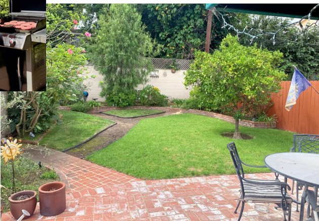
Our backyard (and BBQ!)