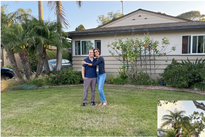
Our home and street