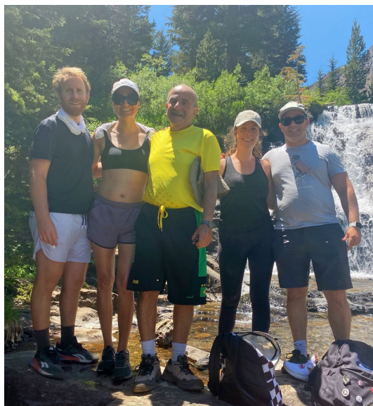
A family hiking trip to Mammoth Mountains