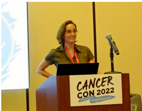
Presenting at a cancer conference