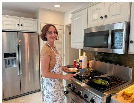
Cooking a healthy dinner