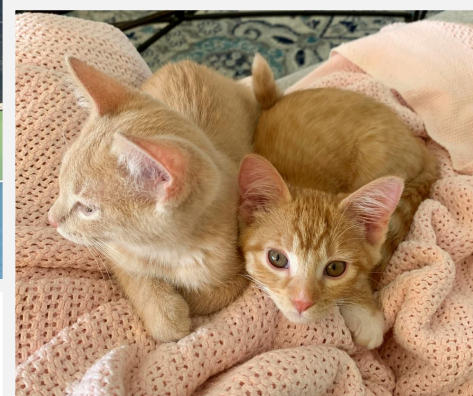
Our Cats, Rascal & Raggie