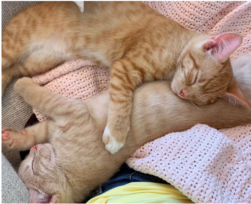
Rascal & Raggie as kittens

Rascal and Raggie are brothers and like typical orange cats — sweet, loving, and a little bit nuts . Once before a vacation we left them at a cat hotel, but within minutes, they jumped into the ceiling! Since then, we gave up on keeping them contained and installed a kitty door. Now, they roam the neighborhood by day and cuddle with us at night.