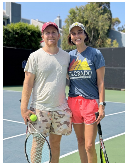
A fun weekend tennis match