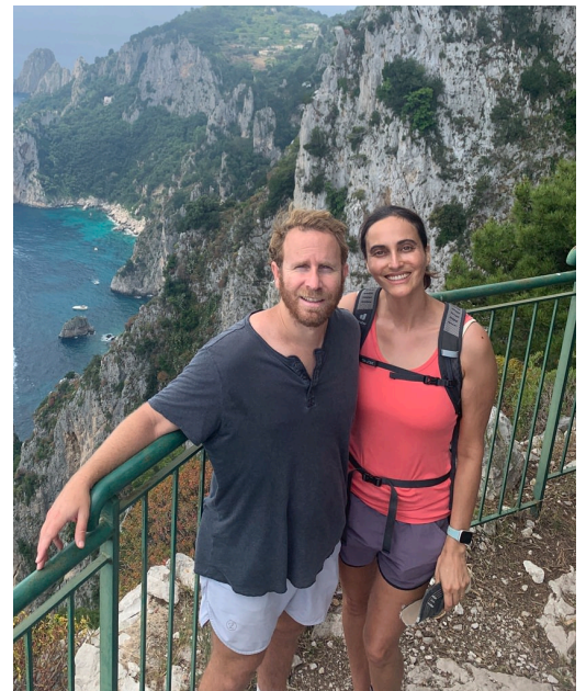
Hiking the coast of Italy

We love hiking. We hike trails near our home every weekend, take yearly hiking trips to Mammoth Mountain, and try to find local trails whenever we travel, especially if we get to see a beautiful view at the end. Recently, we even went on a six-day hiking trip to the coast of Italy – it was the perfect combination of amazing views and even better food!