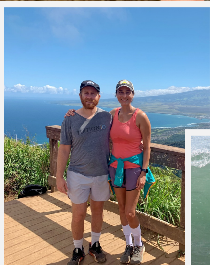
We Love Hiking