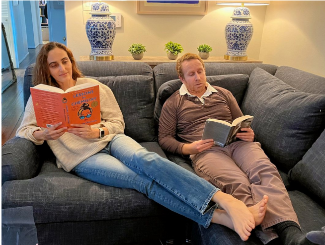
A relaxing weekend afternoon

We love hiking. We hike trails near our home every weekend, take yearly hiking trips to Mammoth Mountain, and try to find local trails whenever we travel, especially if we get to see a beautiful view at the end. Recently, we even went on a six-day hiking trip to the coast of Italy – it was the perfect combination of amazing views and even better food!