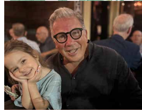
DATE WITH GRANDPA