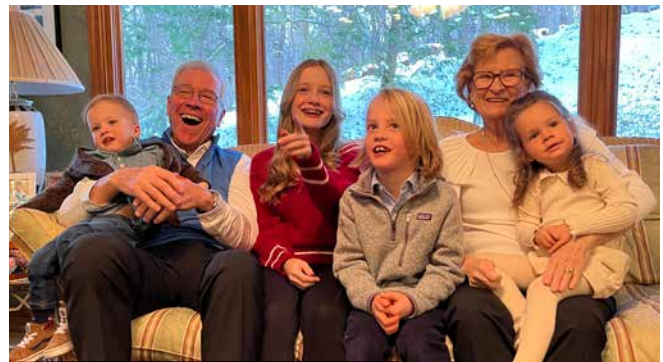
GJ AND GRANDPA LOVE TIME WITH THEIR GRANDKIDS