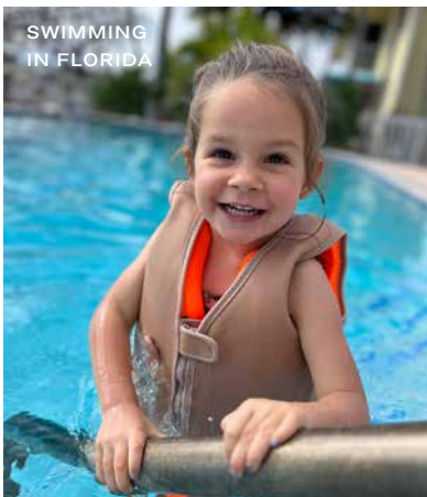
SWIMMING IN FLORIDA